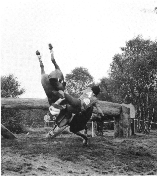
Figure 6. Falling during a jump will increase the height and the force exerted upon the body