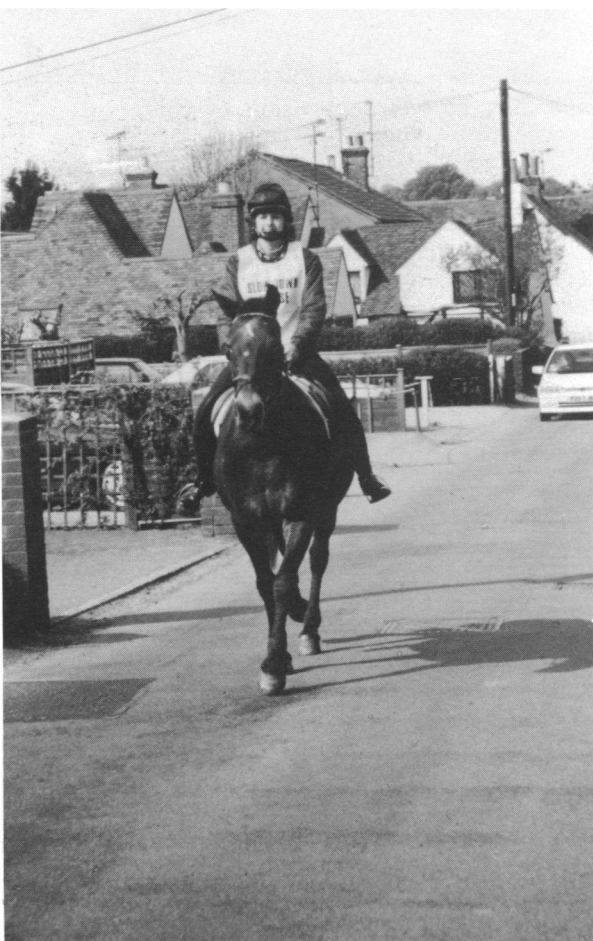
Figure 4. The correct safety equipment, reflective body vest, helmet and boots, but in built-up areas horses and cars do not mix

A comparison of the two groups of accidents revealed that among the minor accidents the horses were better in traffic and more experienced. It is also noteworthy that four serious spinal injuries were incurred by those riders under the age of 20. The