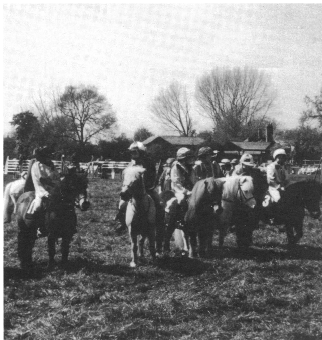
Figure 1. Children at play; competition starts at an early age