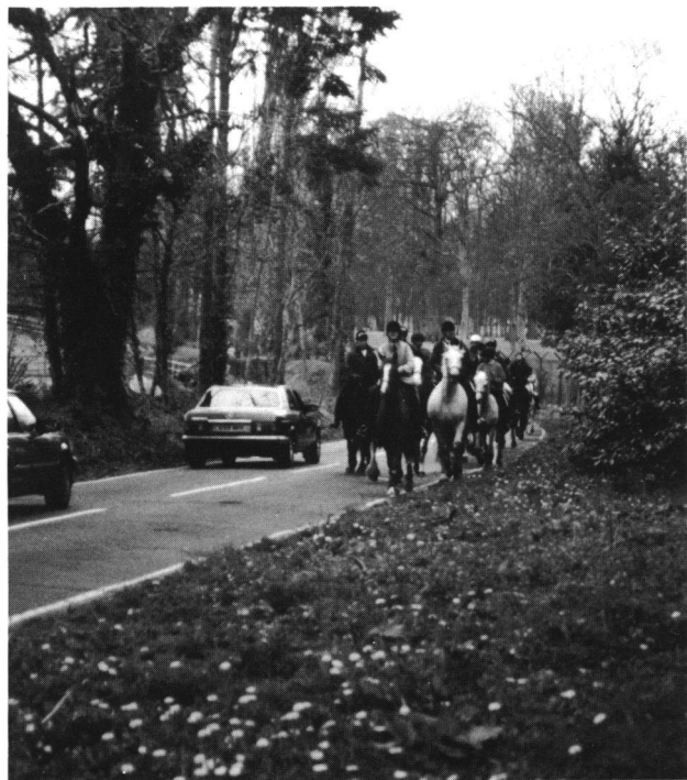
Figure 2. Congested highways in the UK and a lack of routes specifically for horse-riding leads to accidents

In this survey 14 accidents (of which seven were spinal injuries) were attributed to the behaviour of the horse and due principally to the excitement of the occasion (e.g. competition, hunting, fast riding), but in seven instances rider error played a significant role and on two occasions alarm occurred during riding instruction.