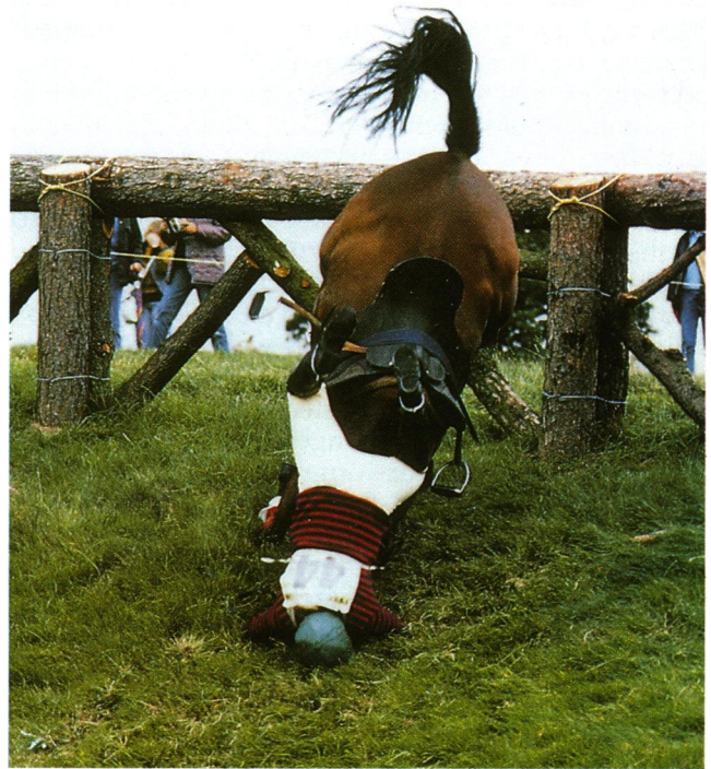
Figure 8. Another graphic example of the head and cervical spine being vulnerable