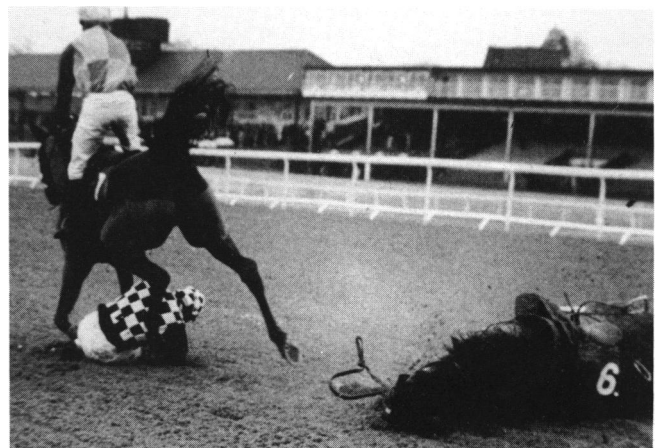
Figure 9. Having survived falling from a horse, the rider may be injured by another horse and kicked or trampled on

the minor group, one had an adequate, harnessed head protection. The main reason for such an accident was that the horse got out of control or failed to be controlled and then the rider was flung off. To understand why this happened at least three questions must be asked. Firstly, was the horse unridable by any rider? Secondly, was the horse unridable for that particular rider? Thirdly, was the horse rideable by that rider under certain situations but not in the type of situation that arose (e.g. too fast, too difficult a jump attempted or the rider, under stress, transmitting the anxiety to the horse)?