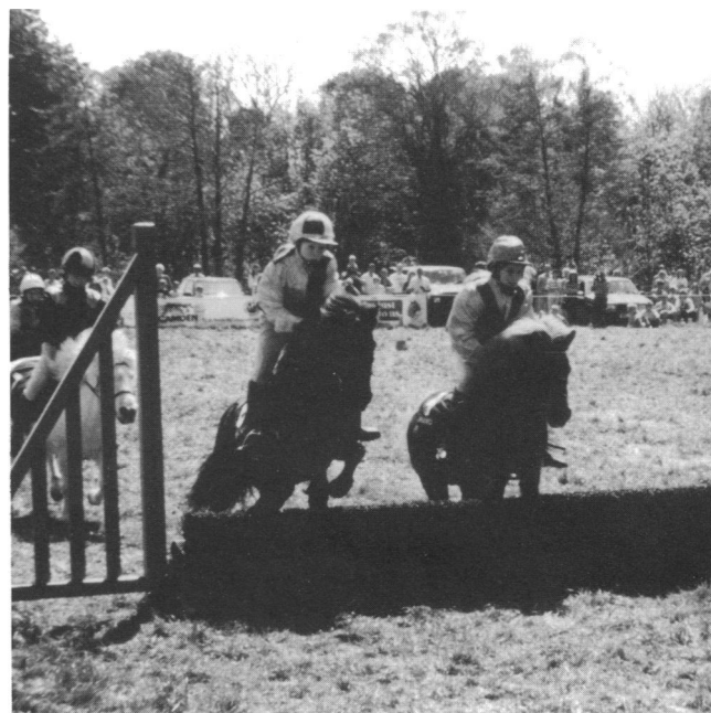
Figure 5. A mini Grand National for ponies; risks increase when leaving the ground

accidents in the major group occurred through the spring and summer, with four riders being under stress (Figure 5). The majority of accidents were preventable: ten were entirely preventable, two possibly so, but six were not preventable. There was insufficient information on the other two cases.