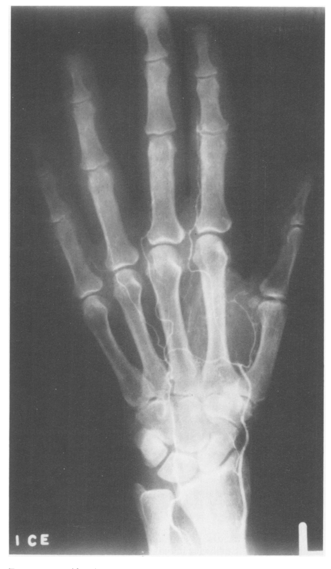
FIG. 1. Magnification hand arteriogram demonstrating widespread palmar and digital arterial obstruction (Case 4).

vein thrombosis recurred in the right leg. The patient died 2 months after limited hand amputation. Pathologic examination of the involved arteries showed no evidence of vasculitis. The details of the case histories are summarized in Table 3.