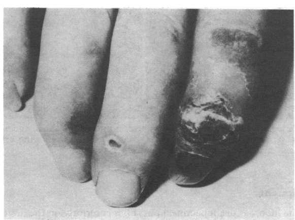
Gangrene of finger tip (case 1).

An 80-year-old man was referred with severe proximal myopathy, Raynaud's phenomenon of recent onset, and weight loss of 19 kg over the preceding two years. There was acrosclerosis of the hands with small areas of necrosis on the finger tips, facial scleroderma and telangiectasias, and