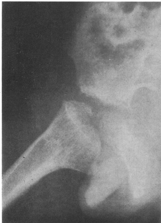
FIG. 3.—Case 1. X-ray at 1 year after second infection. Right femoral head no longer present.

In spite of this confirmation that a defect anywhere in the chain can lead to bone infection in infancy, in our retrospective study we found evidence only of immunoglobulin deficiency and in all but one patient that was of IgA. IgA is unlikely to be responsible itself for the protection against bone infection, but it is the slowest immunoglobulin to reach adult levels, so it is a good case finder for mild degrees of more generalized and transient immunodeficiency. A failure to make IgM anti-