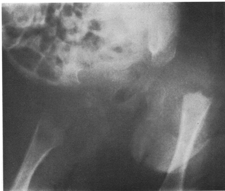
FIG. 1.—Case 13. Immunodeficiency, common varied—at age 2 months. X-ray showing both femora infected and left hip dislocated.