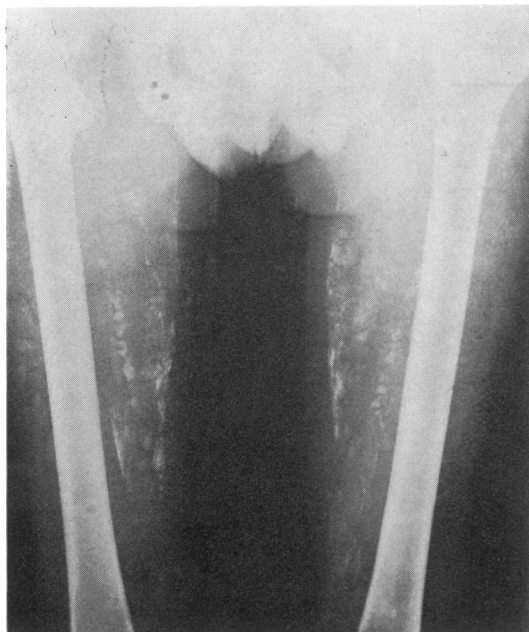
FIG. 1.—Case 1. Extensive subcutaneous calcification 2 years after onset of disease.

Still's disease was made but his facial rash later suggested dermatomyositis. He developed subcutaneous calcification and was given ethanehydroxydiphosphonate (EHDP) 10 mg/kg per day. Radiological examination showed a significant diminution in ectopic calcification after 2 years of EHDP therapy. He was treated with prednisolone 40 mg/day with rapid improvement within a week. This was followed by Synacthen (tetracosactrin) gel 1 mg weekly intramuscularly for 2 years. He has flexion contractures of both hips and both knees and bilateral equinus deformity for which bilateral achilles tenotomy was carried out with good effect. He is unable to stand unaided and can only move around the house on a tricycle. Otherwise his disease has been inactive for the past 10 years.