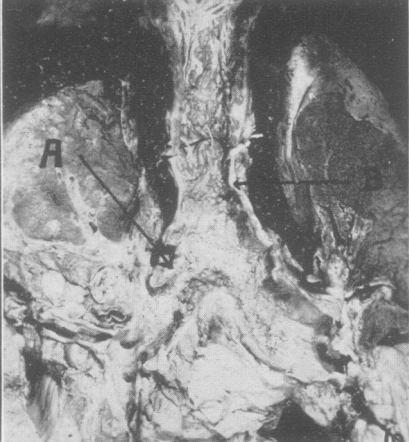
Fig. 7.—Case 2. January, 1934. Recurrence of atelectasis.

Atelectasis of right upper lobe. Fig. 6.—Case 2. August, 1933. Almost complete aëration of atelectatic lobe.