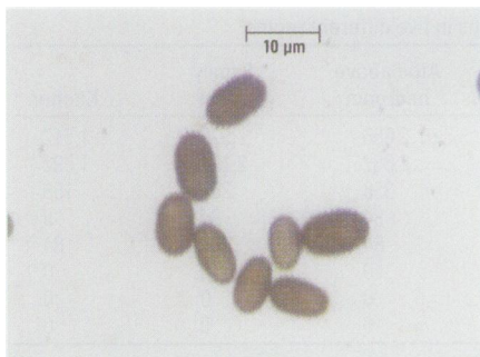
Figure 3. Stachybotrys spores (at 1000× magnification) are ellipsoid in shape, are 4–6 μm × 7–12 μm in size, and have an aerodynamic diameter of 5 μm (10). Particles with aerodynamic diameters < 7 μm can have appreciable (> 9%) alveolar deposition (11).

potent tricothecene mycotoxins (10,12–17). These include the macrocyclic tricothecenes Roridin E, Roridin L-2, Satratoxin H, and Satratoxin G, all of which are potent protein synthesis inhibitors and highly cytotoxic to eukaryotic cells. Experimental laboratory animals have shown physiologic effects similar to those observed in farm animals with stachybotrytoxicosis. Tricothecenes are thought to be the primary reason for the health problems. Stachybotrys spores are also capable of producing spirolactones, spirolactams, and cyclosporin, mycotoxins with immunosuppressant effects (10). Infants may be especially susceptible to the effects of spore-borne mycotoxins due to their high breathing rate, immature lungs, and rapid growth. Exposure to tobacco smoke may serve to augment overt expression of pulmonary bleeding.