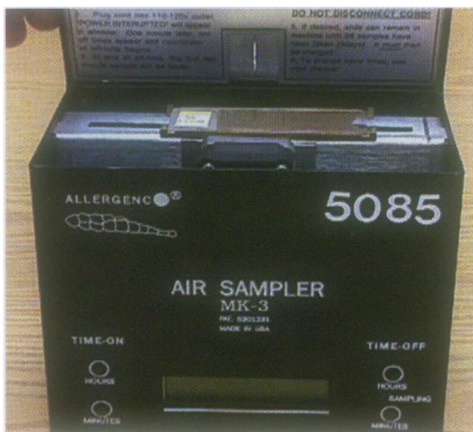
Figure 1. Photograph of the Allergenco MK-3 air sampler (Allergenco/Blewstone Press, San Antonio, TX). Airborne particulates drawn through a small opening (1.1 × 14.5 mm) in the lid impact onto a microscope slide underneath. Both viable and nonviable spores are detected by direct microscopy.

We collected surface samples with transparent cellophane tape (tape prep) for semiquantitative measurement of mold contamination. All spores were classified into their respective genera based on shape, size, and color.