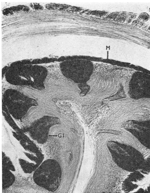
Fig. 2. Transverse section of post-crop oesophagus (×75). Black staining depicts butyrylcholinesterase activity. Dense staining was present in the muscularis mucosae (M) and mucosal glands (Gl).