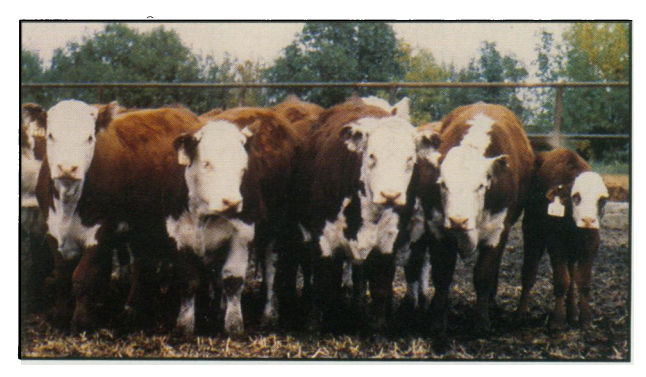
Figure 3. This photograph shows the extreme variation in weaning weight that can occur between healthy normal calves and persistently infected calves. The small calf is a persistently infected cal weaned in 1993 and is the same age as the other healthy heifers in the photograph.

In 1992, 560 calves were tagged. Bovine viral diarrhea virus was isolated from 2 of the 14 plasma samples collected for vitamin E and selenium assays from unthrifty calves at branding in April 1992. The 2 BVDV-