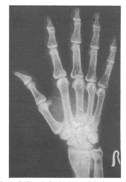
FIG. 1—Case 2. Radiograph showing increased density, coarse trabeculae, and cortical erosions of the phalanges, especially of the fifth finger. Crippling fluorosis with tertiary hyperparathyroidism. High plasmacalcium (11 mg/100 ml). Parathyroid adenoma found on exploration of the neck.

Fluoride in Drinking Water.—Twenty samples of water were analysed from four wells located at different places in the endemic area and showed a fluoride concentration of 10:3-13:5 p.p.m. The mean intake of fluoride from water alone by each patient was 25 mg/day, and when it is realized that the same water had been used for processing and cooking the food the intake becomes still larger.