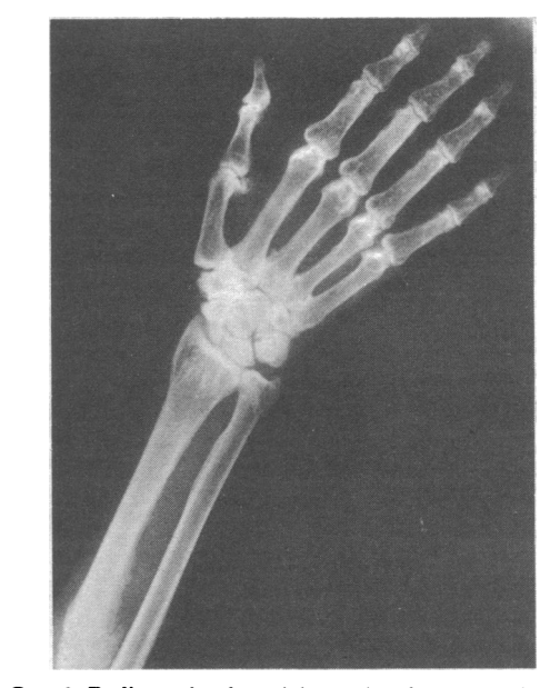
FIG. 2—Case 2. Radiograph taken eight weeks after removal of parathyroid adenoma showing healing of cortical erosions in the phalanges. Forearm shows calcification of the interosseous membrane as a diagnostic feature of skeletal fluorosis.

FIG. 1—Case 2. Radiograph showing increased density, coarse trabeculae, and cortical erosions of the phalanges, especially of the fifth finger. Crippling fluorosis with tertiary hyperparathyroidism. High plasmacalcium (11 mg/100 ml). Parathyroid adenoma found on exploration of the neck.