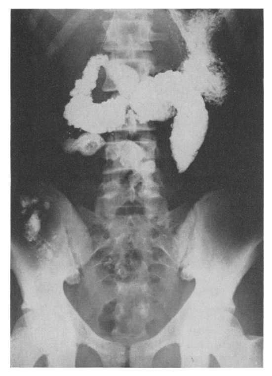
Fig. 1. Roentgenogram, A-P view, showing almost complete obstruction of the proximal jejunum. The opaque media seen caudad to the point of obstruction was that used at a previous examination, 72 hours prior to the development of the obstruction seen above.

levels were most prominent in the upper left quad-