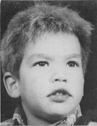
Fig. 1 General appearance of the hair of the patient.

The difficulty in combing the boy's hair met with little concern on the part of the parents, because the father had had similar hair during infancy, which had gradually become 'normal' at about age 5 years. The paternal grandfather and great-grandfather were also known to have had this unusual scalp hair in their infancy. No other family members were affected.