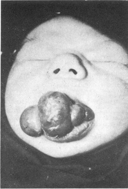
FIG. 1.—Case 1: clinical appearance 3 hours after birth.