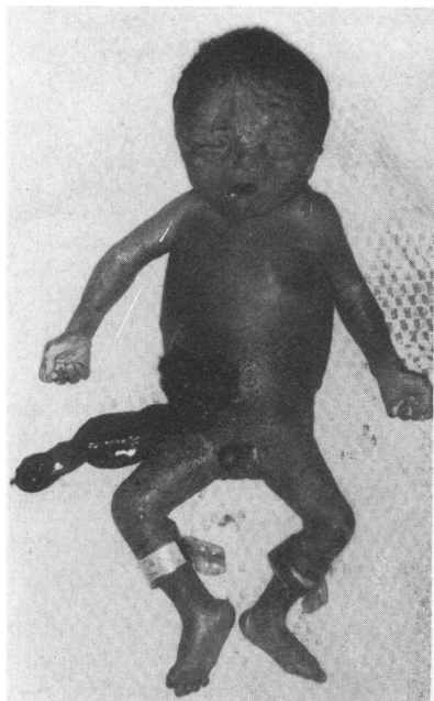
FIG. 2.—Case 472. Note maceration, flexion deformity of fingers, short great toes, small penis, grossly oedematous umbilical cord.

Normal placenta with grossly oedematous umbilical cord; single umbilical artery. Small penis; undescended testes. Oedematous legs. Brain normal. Heart enlarged with transposition of the great vessels and ventricular septal defect. Malrotation of the ileum and ascending colon; absent appendix. Meckel's diverticulum with ectopic pancreatic tissue at its tip. Left hydroureter with ureteric stenosis, right double ureter. See Fig. 2.