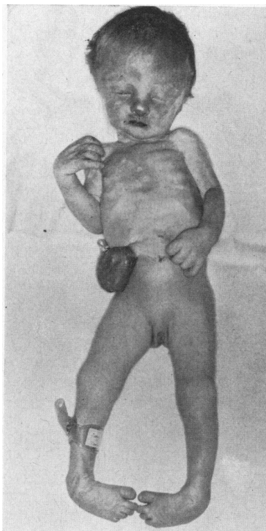
FIG. 3.—Case 387. Note exomphalos, talipes, short great toes.

Case 387. Karyotype 47,XX,+18; age 48 hr; gestation 38 weeks; weight at necropsy 1249 g. Multiple external abnormalities. Odd facies. Nipples widely spaced. Exomphalos. Bilateral partial syndactyly of 3rd and 4th fingers. Flexion deformity of both thumbs, but no flexion deformity of other fingers. Bilateral single transverse palmar creases. Bilateral talipes with rocker-bottom feet; short great toes. Brain normal. Oesophageal atresia, jejunal stenosis. Heart: atrial septal defect; ventricular septal defect, mitral