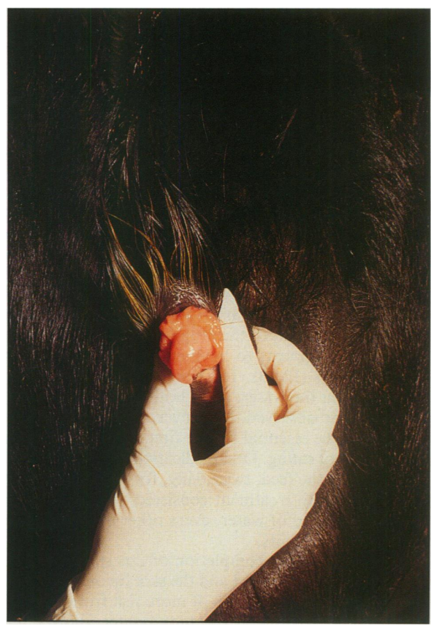
Figure 1. Glans penis-like structure exposed by digital manipulation.