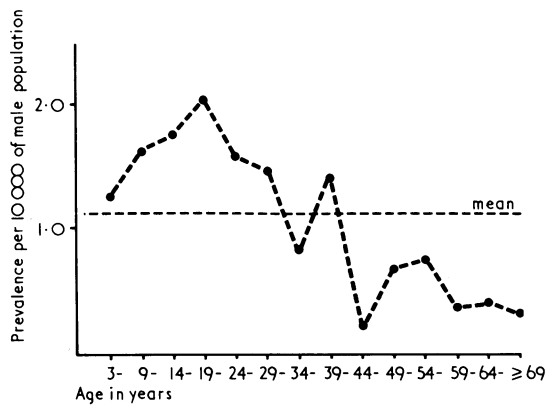
FIG 1—Prevalence of haemophilia in west of Scotland according to age in 1974.

represents a more accurate estimate of the prevalence of haemophilia in the community, given modern treatment, then the number of haemophiliacs can be expected to increase by 81% from greater life expectancy alone. Such an increase in the next few decades would have major financial implications in the provision of satisfactory medical care. We have attempted to assess the cost of treating haemophilic patients and to predict changes in cost that might result from setting up home treatment programmes.