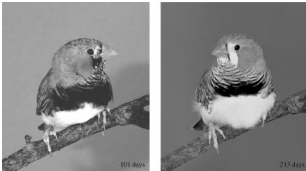
Figure 2. An example of a male zebra finch reared on a seed-only diet at 101 days of age showing abnormal areas of melanistic plumage (left) and the same individual after its second complete body moult aged 213 days (right).