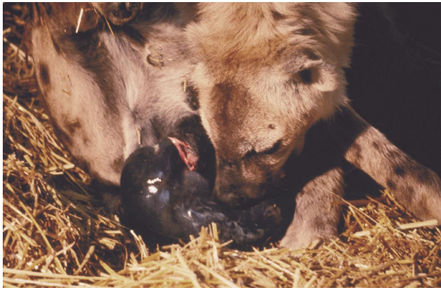
Figure 1. Parturition in a normal, nulliparous female spotted hyena, resulting in a stillborn cub. The typically large cub is still in the amniotic sac, with the head adjacent to the torn clitoral meatus. The placenta and remnants of umbilical cord are visible within the stretched clitoral opening.

to the developing female foetus and could potentially account for her male-like external genital morphology.