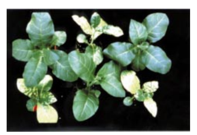
Figure 1. An early, clear demonstration of coat-proteinmediated resistance against TMV in transgenic plants. Each of the plants was inoculated with a severe yellow strain of TMV ten days prior to the photograph.

Following the report by Powell Abel et al. (1986) we conducted a series of studies using CP(+) transgenic N. tabacum cvs Xanthi nn and Xanthi NN to charac-