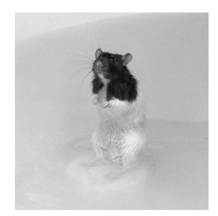
Figure 1. The watermaze. A rat stands on the hidden escape platform inspecting distal cues. After very limited amounts of training, the animal learns to navigate relatively directly to this location in space from any starting point.

I first met Lynn Nadel and John O'Keefe in 1973. They told me about place cells and emphasized the need for new ways to study spatial learning. I was impressed by the assertion that was later to become the first two sentences of their 1978 book: 'Space plays a role in all our behaviour. We live in it, move through it, explore it, defend it' (O'Keefe & Nadel 1978). I carried out my last behavioural experiment in an operant chamber in 1972 and have never been tempted back into the world of response rates and schedules of reward and punishment. Instead, I tried to re-invent tasks reminiscent of an earlier era of animal learning in which navigation through extended space was critical, but in a manner that better fitted the new physiological findings. A key issue for me was that place cells