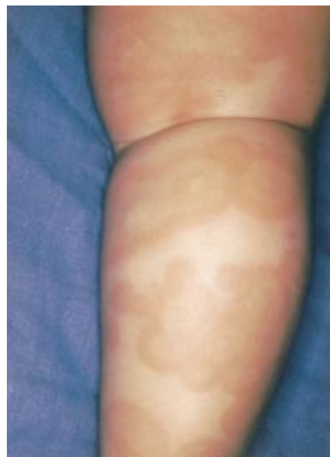
Figure 3 Example of most frequent EM misdiagnosis, acute urticaria with haemorrhagic cockade pattern.

Three patients received thalidomide for either acute illness (one case of SJS) or severe recurrent disease (one case of EM major and one case of SJS). While the patient with recurrent EM major was well controlled by thalidomide (case 22), the one with recurrent SJS, a 12 year old boy (case 37) had a severe recurrent disease of unknown aetiology (eight relapses in four years) with primary severe mucous membrane involvement and digestive bleeding as a result of oesophageal involvement confirmed by endoscopy. Relapses were initially controlled by thalidomide taken in the first hours of the disease, but then a severe relapse with skin