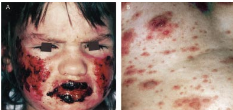
Figure 2 (A) SJS with skin and major mucous membrane involvement. (B) Widespread blisters of the chest in a child with SJS.

Twenty four of 66 cases were clearly not affected by EM or SJS. Among these patients nine had urticaria, seven had non-EM drug reactions (maculopapular rash in five cases and toxic pustuloderma in two cases), two children had papular urticaria, two others acute haemorrhagic oedema, and two cases had varicella. Kawasaki disease and staphylococcal scalded skin syndrome were also noted (one case each).