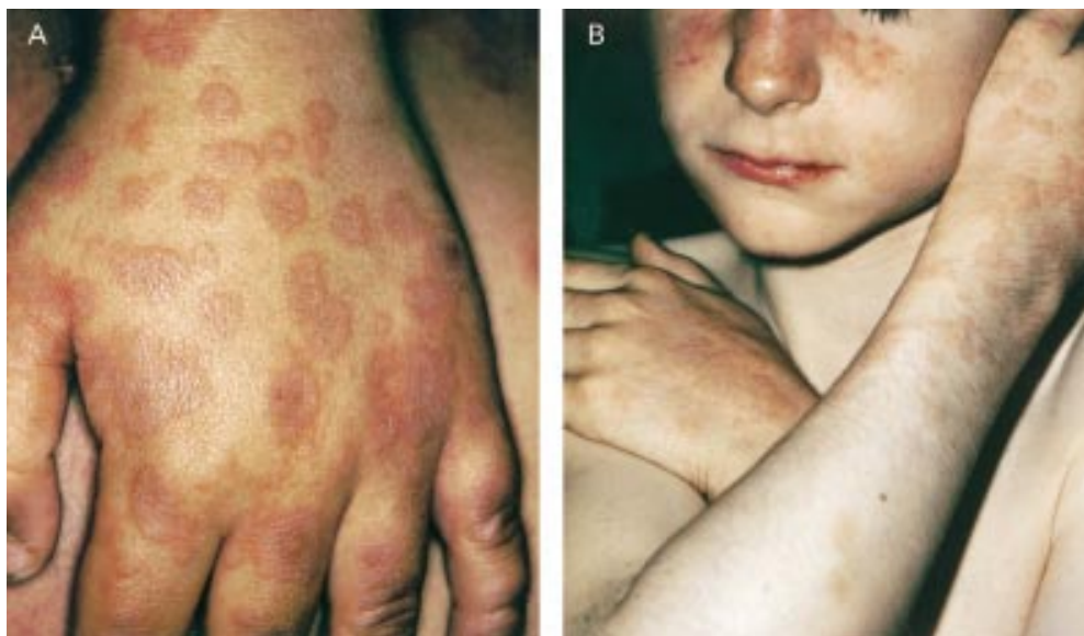
Figure 1 (A) Typical targets of EM associated with raised oedematous papules on hand. (B) Typical targets of EM acrally distributed in a child with labial herpes.

herpes score of Assier and colleagues. 17 This score (0–4) was established by adding the following criteria (one point each): recurrent EM, history of recurrent herpes, recent clinical herpes (preceding EM within three weeks), and a demonstration of a recent herpes simplex virus infection (virus isolation, positive immunofluorescence, or seroconversion). EM was firmly attributed to herpes simplex virus infection for a score of 2 or more, without any other suspected aetiology. Herpes virus infection was only suspected for a score of 1.