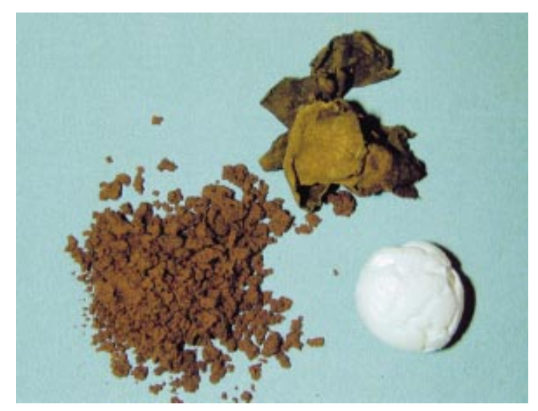
Figure 2 Photograph of ingredients of the paste.

leaves, lime, and freeze dried coffee mixed with water (figs 1, 2^2 ).