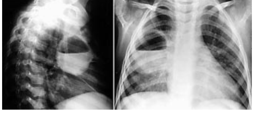
Figure 2 Anteroposterior and lateral chest x ray showing air fluid level into the cavity, as seen on day 14 after admission. Note the small amount of free pleural effusion in the right pleural cavity.