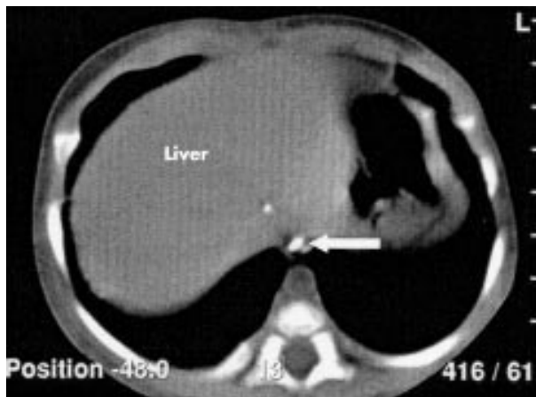
Figure 3 Computed tomographic image of an axial section through the upper abdomen depicting the liver with one spot in the parenchyma. The arrow points to a white spot in the inferior vena cava.

and its incidence is unknown. No racial or sex preference has been reported.