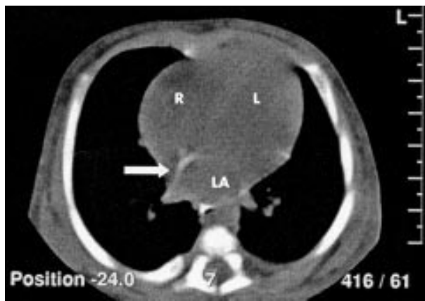
Figure 2 Computed tomographic image of an axial plane through the heart depicting the left atrium (LA) with the arrow pointing to the atrial septum. Note that the image intensity of the atrial septum approaches that of the ribs and is more intense than the ventricular walls and ventricular septum, which cannot be clearly distinguished. R, Right ventricle; L, left ventricle.