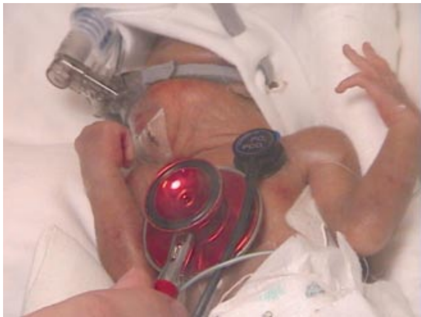
Figure 1 Auscultation of a premature (25 weeks gestation) baby.

Auscultation with a large stethoscope head may place undue force on the chest or abdomen of a tiny baby. Using the same ratio (1:15), a 70 kg male would have a stethoscope head weighing 4.4 kg placed on his chest, an uncomfortable experience for both patient and examiner! Auscultation and the associated pressure applied by the auscultator may well be an unpleasant experience for extremely low birthweight infants. Care should be taken to use the smallest stethoscope possible and to apply minimal pressure when examining low birthweight infants.