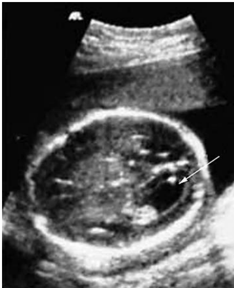
Figure 1 Mild fetal ventriculomegaly (11 mm) with enlargement of the posterior horn of the lateral ventricle (arrowed).