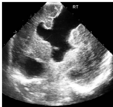
Figure 3 A neonatal coronal ultrasound scan of the head showing right parietal schizencephaly in a baby thought to have isolated ventriculomegaly as a fetus.