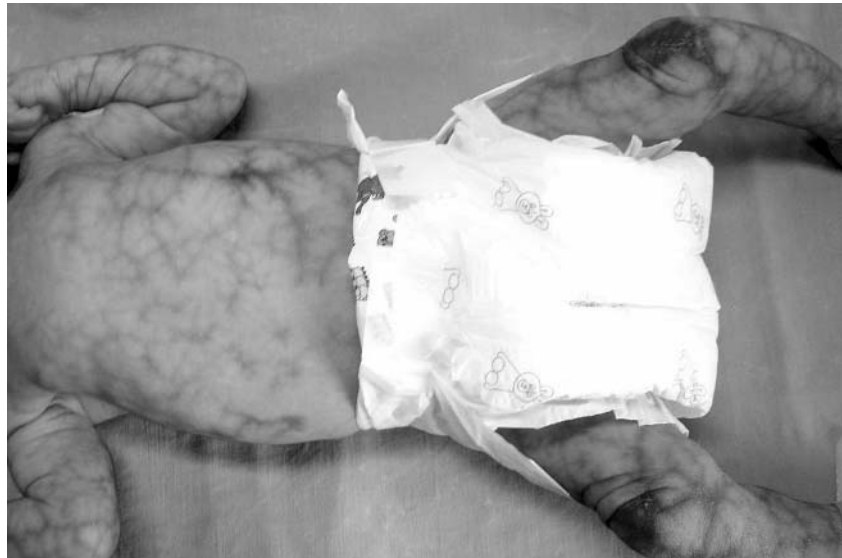
Figure 1 Photograph showing generalised cutis marmorata, dilated superficial veins, and telangiectasia involving the trunk and limbs. Consent for this figure was obtained from the patient's parents.

Cutis marmorata telangiectatica congenita 1 is a rare benign sporadic congenital vascular anomaly characterised by persistent cutis marmorata, telangiectasia, and phlebectasia and often associated with skin atrophy and ulceration. 2 The cutaneous lesions commonly occur on the legs, arms, and trunk and rarely involve the face and scalp. Associated abnormalities such as body asymmetry, vascular and neurological anomalies, glaucoma, macrocephaly, and psychomotor retardation occur in many patients. The diagnosis is mainly clinical, and prognosis is generally good, with cutaneous lesions improving during infancy. There is no specific treatment, and long term follow up is indicated with associated abnormalities.