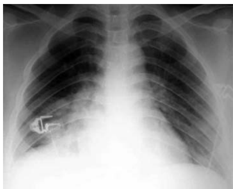
Figure 1 This 12 year old girl with severe acute respiratory syndrome presented with fever, unproductive cough, and constitutional symptoms. The chest radiograph revealed bilateral consolidation of the lower lobes on day 6 after the onset of fever.

Chemokines and proinflammatory and anti-inflammatory cytokines were longitudinally monitored in a small group of paediatric patients. 21 22 Interleukin 1 \beta , a proinflammatory cytokine, was substantially upregulated, suggesting selective activation of the caspase-1 dependent pathway in infected macrophages. 21 Interferon- \gamma -inducible protein-10 (IP-10) and monokine induced by interferon- \gamma (MIG) were also appreciably increased at the acute phase of the infection. 22 Other important proinflammatory cytokines, interleukin 6 and tumour necrosis factor \alpha , were, however, only slightly