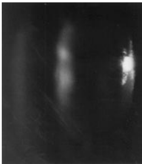
Figure 2 Slit-lamp photography of cataract grade 7 (case 15).

approximately one third of the area of the posterior subcapsular region within the dilated pupil. In addition, advanced cuneiform cortical opacities were observed at this stage. No case had severe radiation cataract changes (stages 9,10) characterised by advanced cataract. 18