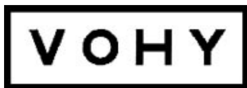
Figure 1 Glasgow acuity cards. Each has four letters per line and controls contour interaction by means of a surrounding crowding bar (after McGraw and Winn 6 ).

The SGT is a development of the original Stycar test. 19 It was originally designed for research into visual defects with physically and mentally handicapped children and, in addi-