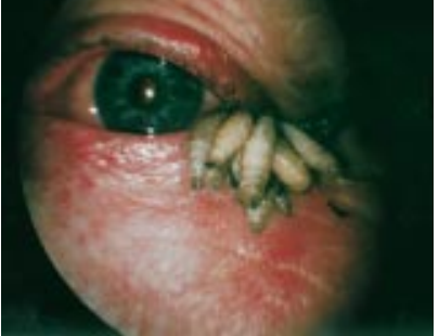
Figure 1 Fish hook loaded with nine live maggots embedded in the left upper eyelid.

left upper evelid. He had cut off the line but made no attempt to remove the hook. The fish hook had pierced the evelid from its conjunctival aspect near the outer canthus. It was loaded with nine live maggots that were used as bait (Fig 1). The left eye showed a small superficial linear abrasion of the cornea but was otherwise unremarkable and the visual acuity was 6/6. Under local anaesthesia after removal of the maggots, the hook was rotated so that the barb emerged through the eyelid skin. The barb was snipped off using a wire cutter and the hook was rotated back and removed. The patient was treated with saline irrigation of the conjunctival sac and a topical antibiotic and he made an uneventful recovery.