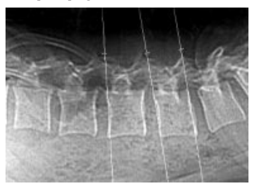
Figure 1 A scouth view representing the three standardised views positioned accurately along the upper end plate of L3 and the upper and lower end plate of L4.

The CT images were enlarged, visualised on a computer screen, and analysed. Analysis of the multifidus muscle consisted of two steps using a computer program.