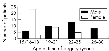
Figure 1 Frequency distribution according to sex and age at the time of surgery.

Ordinal or categorical data were analysed using non-parametric statistical tools; in the assessment of differences between groups in terms of categorical outcomes, the \chi^2 test was used, and the Mann-Whitney U test was used in the assessment of differences in CSAS and CSFS scores.