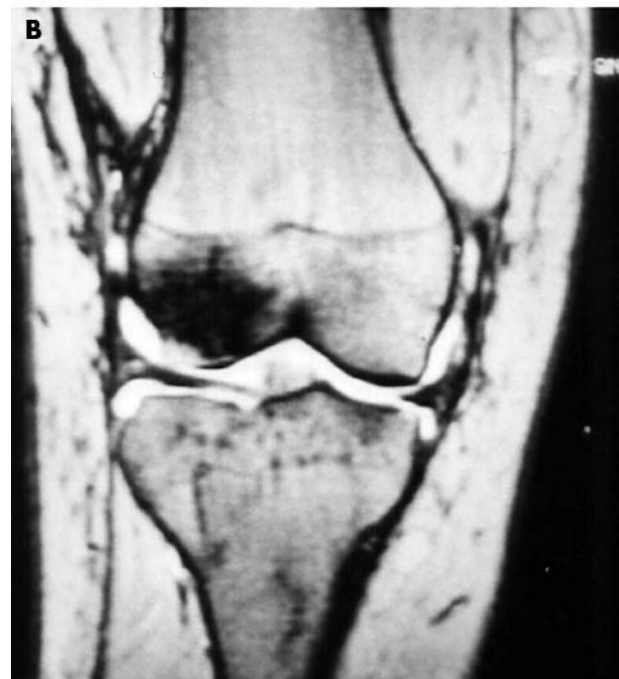
Figure 3 Coronal proton density images showing the kissing contusion low density signal areas (arrows) on the lateral femoral condyle (A). A more posterior section (B) shows the contusion on the lateral tibial condyle.

bone contusion on the lateral femoral condyle was still detectable but was more diffuse than on the initial MRI.