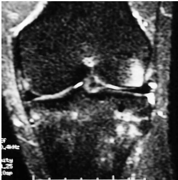
Figure 2 Coronal FSE inversion recovery image, showing kissing contusion in the lateral compartment as areas of high intensity signal. The surrounding medullary bone (fatty marrow) is suppressed and appears as low density (null) signal.

lesion of the lateral collateral ligament. In four of the cases (table 2, cases 4, 5, 12, and 13), the bone contusion was located on the terminal sulcus on the lateral femoral condyle (type I and type II) and on the posterolateral tibial condyle (type III). In three cases (table 2, cases 14, 15, and 16), the bone contusion was located on the lateral femoral condyle (type I and type II) and on the posterior lip of the medial tibial condyle (type III). One case (table 2, case 6) involved the medial compartment, with a type I lesion on the medial femoral condyle and on the posterior lip of the medial tibial condyle.