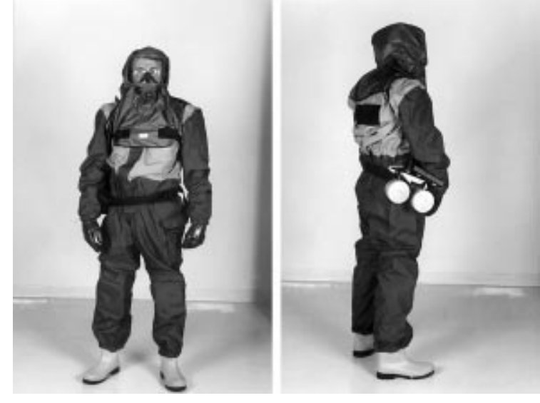
Figure 1 TST-Sweden chemical protection suit.

could be carried out safely and effectively while wearing the chemical protection suits that are available in the department.