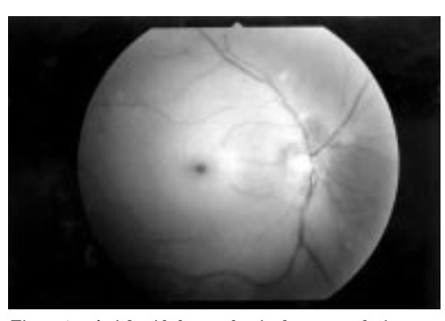
Figure 1 A right sided central retinal artery occlusion. Note the retinal whitening that is most obvious at the posterior pole, thus giving rise to the characteristic cherry-red spot at the fovea.

The ophthalmoscopic features of acute CRAO include a whitish, oedematous retina attributable to infarction, especially at the posterior pole where the nerve fibre layer and ganglion cell layer are thickest. As these layers are absent in the fovea, the underlying choroidal vascular bed can be seen in this area thus giving rise to the classic cherry-red spot (fig 1). In the presence of a patent cilioretinal artery, the retinal region served by the unobstructed vessel is not involved (fig 2). Disc pallor and retinal vascular