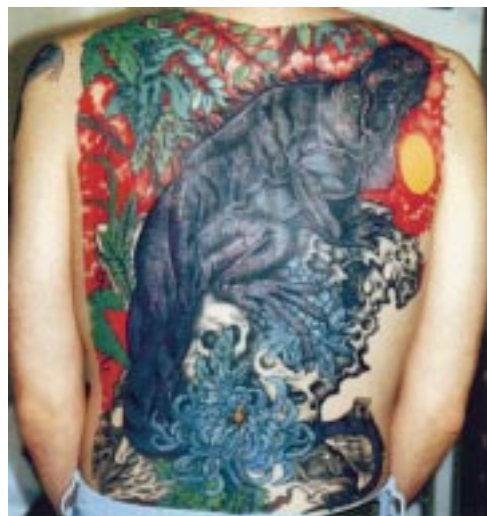
Figure 1 Patient's back with completed tattoo.

Staphylococcus aureus sensitive to vancomycin, gentamicin, erythromycin, penicillin, and flucloxacillin was isolated from multiple blood cultures. After 48 hours of appropriate antibiotic treatment (vancomycin and gentamicin) an aortic valve replacement was performed using a St Jude's metal bileaflet prosthetic