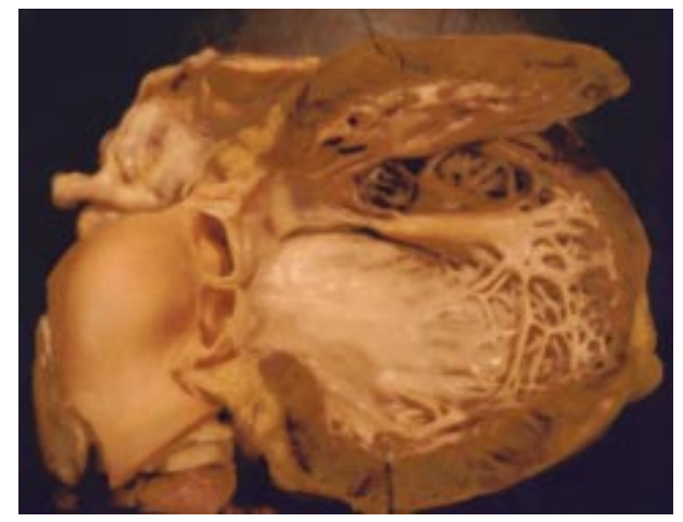
Figure 1 Necropsy finding of dilated cardiomyopathy in a patient who died of AIDS. There is remarkable dilatation of the left ventricular cavity with slight myocardial hypertrophy.

their surfaces for extended time periods and may chronically release cytotoxic cytokines (tumour necrosis factor- \alpha (TNF- \alpha ), interleukin-6 (IL-6), endothelin-1 (ET-1)) contributing to progressive and late tissue damage in both systems independently of HAART.<sup>9</sup>