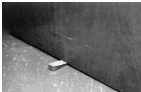
Figure 2 Triangle shaped plastic stopper at bottom of door preventing closure.