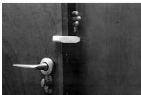
Figure 1 Rubber stopper in door at lock side preventing crushing of fingers.

ers can be fitted to the door on the lock and hinge sides so that the child cannot completely close the door. (3) A chain can be fitted to the wall beyond the reach of the child, hooked to the door, and kept opened. (4) A triangle shaped wooden, plastic (fig 2), or rubber stopper can be kept at the bottom of the door