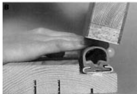
Figure 4 Danish "pinch free" door (A) and the fingers jamming during closing (B). The rubber yields so that the finger is not crushed between the wooden parts of the door, preventing or reducing damage to the fingers.