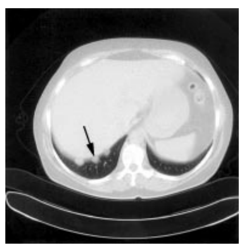
Figure 1 Thoraco-abdominal computed tomography scan showing three pleural metastases in the right sinus (arrow).

A 60 year old woman was referred to the department of maxillofacial surgery at the University Hospital Nijmegen, the Netherlands. The referring ear, nose, and throat surgeon had attempted to excise a palatal lesion that was diagnosed as "adenocarcinoma NOS (not otherwise specified)". Revision of the sections at our pathology department revealed an incompletely resected PLGA. After a complete examination, the tumour was staged cT_xN_0M_0 . Two months after the initial biopsy, a wide resection of the tumour was performed. Histopathological examination confirmed the diagnosis and ample resection margins. The patient was enrolled in a routine follow up with periodical physical examination as well as chest x rays. The follow up was uneventful until 34 months after the initial treatment a routine chest x ray revealed several pleural lesions in the right sinus that were confirmed by computed tomography scan to be suspicious of a neoplasm (fig 1). Both clinical history, especially with respect to pulmonary complaints, as well as mammography and thyroid scan were normal. The patient was not known to have been in contact with asbestos. Several biopsies were performed through thoracoscopy. After confirmation of the metastatic origin of the lesions, a lobectomy was