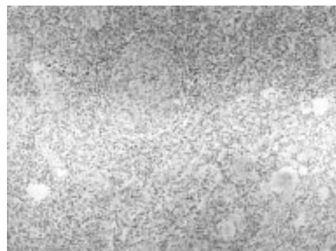
Figure 1 Lymph node with germinal centre surrounded by sinuses filled with numerous multinucleated foreign body giant cells containing refractile silicone particles (haematoxylin erythrosin saffron stain; magnification, \times 100 ).

The specimen consisted of a lymph node, approximately 25 mm in diameter, with a light tan appearance and a homogeneous consistency on cut section. The specimen was separated into several portions. One segment was fixed in formalin, embedded in paraffin wax, and processed for light microscopy and immunohistochemistry. Another portion was frozen. Another segment was processed for cytogenetic and flow cytometry evaluation. The formalin fixed sections were stained with haematoxylin erythrosin saffron (HES), Giemsa, periodic acid Schiff, Perls, and for CD20, CD3 and BCL-2 (all from Dako, Glostrup, Denmark) using the streptavidin-biotin method. The frozen sections were stained with oil red O. There was no abnormality on cytogenetic examination and no monoclonality detected in flow cytometry. The histological examination showed follicular hyperplasia and numerous multinucleated foreign body giant cells within sinuses and interfollicular spaces (fig 1). The immunohistochemistry study