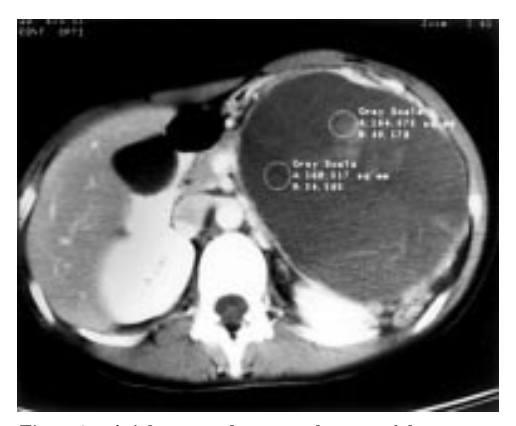
Figure 1 Axial computed tomography scan of the upper abdomen shows a circumscribed tumour in the transverse mesocolon, which dislocates but does not infiltrate the surrounding organs.

In addition to routine and immunohistochemical staining, electron microscopy, flow cytometry, fluorescent in situ hybridisation (FISH) on tumour imprints, and comparative genomic hybridisation (GCH) were also performed to characterise the immunophenotype and ultrastructure, the ploidy, the p53 (17p13.1, biotin labelled; Oncor, Gaithersburg, USA), and the RB1 (13q14.2, biotin