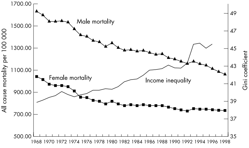
Figure 1 Income inequality (Gini) and sex specific, age adjusted, all cause mortality USA, 1968–1998.

the work of Weitkunat and Wildner, who basically develop the ongoing argument as to whether it is appropriate to adjust for covariates that may be causal intermediates—rather than founders—in statistical models. 18 They show that such adjustment will tend to accentuate apparent effects of factors more proximal to the outcome. In other words in the case of psychosocial factors that may mediate the relation between social position and health adjustment will tend to lead to the psychosocial measure appearing to have an effect "independent" of that of the more distal (and perhaps determining) social position measure. Psychosocial exposures are amenable to experimental manipulation.19-21 If they weren't how could they form the basis for useful health interventions? Experiment remains the most powerful means of reducing the risk of being misled by confounding and selection bias (with "Mendelian randomisation"—in essence a natural experiment—a close second).22 We doubt that Dr Singh-Manoux is really suggesting that we abandon randomised controlled trials in favour of observational studies analysed using structural