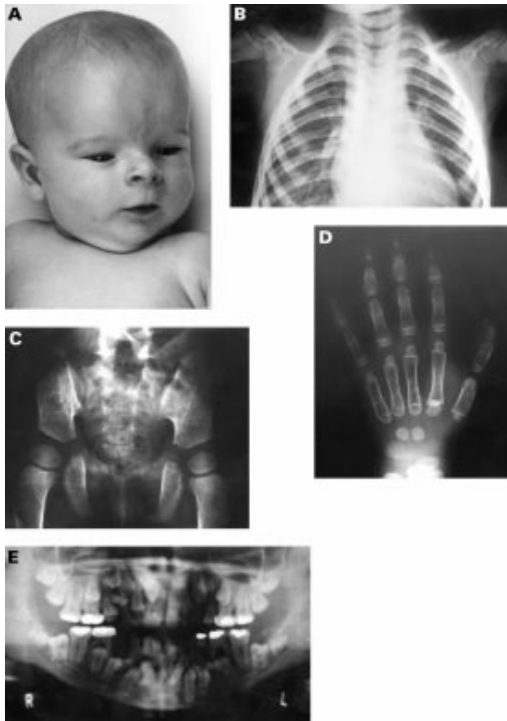
Figure 1 Typical clinical and radiological findings in CCD. (A) Facial appearance in a 6 month old boy. Note large, brachycephalic skull, frontal and parietal bossing with large anterior fontanelle, and the appearance of a small face. Other characteristic features include widely spaced eyes, low nasal bridge, reduced nasal length, but increased nasal width and protrusion. (B) Chest radiograph showing cone shaped thorax and left clavicular hypoplasia and aplasia on the right side. (C) Pelvic abnormalities in a 4 year old girl. Note hypoplasia of the iliac wings, broad femoral necks with large epiphyses, and unossified symphysis pubis. (D) Hand radiograph of a 2½ year old female showing hypoplastic distal phalanges, accessory epiphyses of the second metacarpal, and long second metacarpal. (E) Pantomographic view of the permanent dentition of a 16 year old female. Note multiple, unerupted, supernumerary teeth.

the aim of actively erupting and aligning the impacted permanent teeth. 23–25