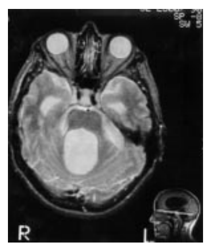
Figure 3 Brain MRI of patient III-2 showing communicating hydrocephalus.

no cognitive or urinary disturbance. There was no other medical history of note and she was on no medication. Bedside cognitive assessment was normal. Her gait was broad based and spastic. There were saccadic intrusions into pursuit eye movements; examination of the cranial nerves was otherwise normal; there was no disc swelling. Tone was increased in the legs with mild pyramidal pattern weakness, brisk reflexes, and bilateral extensor plantar responses. There was mild limb ataxia. The remainder of the neurological examination was normal. General examination was normal.