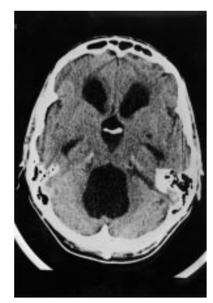
Figure 2 CT of patient II-1 showing communicating hydrocephalus.