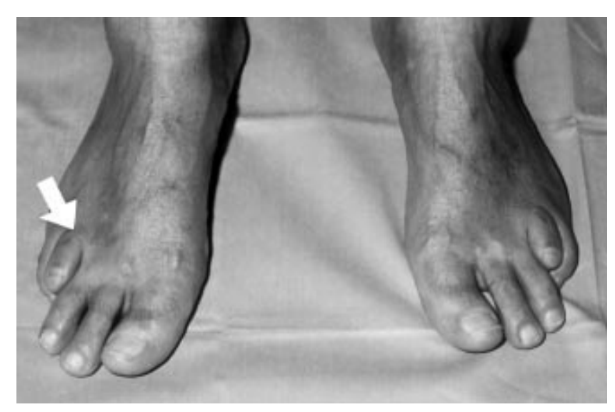
Figure 1 Refsum's disease in an Arabian patient. Symmetric short fourth toes (arrow).

Plasma samples for phytanic acid and phytanyl triglyceride assays in the patient's relatives became available in 1999. The family has lived in the same location in southern Egypt for several generations; the father's mother and the mother's grandmother were sisters. The patient has two brothers (born 1951 and 1962) and two sisters (born 1952 and 1954). The elder brother has symmetric weakness of legs starting at 28 years of age and night blindness. Neurological examination at the Cairo University Hospital in 1986 documented severe sensorimotor neuropathy with wasting and weakness of both legs. Concentration of phytanic acid in plasma was increased (994 µmol/l) and diphytanyl and monophytanyl triglycerides (1% and 12% of total triglycerides) were found, substantiating a diagnosis of Refsum's disease. Both children of the newly detected patient as well as both sisters and their children are healthy. Our patient's younger brother seems healthy, but plasma samples were not available. Our