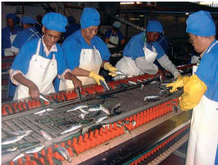
Figure 3 Fish sorting activities generate ergonomic hazards due to high conveyor belt speed, repetitive work, prolonged standing, and abnormal postures. Unprotected handling of fish results in irritant contact dermatitis and urticaria.

example, non-specific bronchial hyper-responsiveness, skin patch tests with fresh fish) can be used to detect early inflammation, allergic sensitisation, or adverse health outcomes such as asthma, extrinsic allergic alveolitis, or contact dermatitis among affected workers. 2, 14