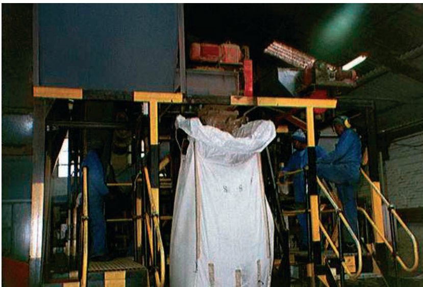
Figure 2 Bagging of fishmeal causes spillage and aerosolised dust particulate if inadequately removed by local exhaust ventilation systems. Hearing protectors are worn by some workers. Mechanical hoisting of bags prevents ergonomic hazards.

for excessive noise exposure among cannery and fishmeal operators require the institution of hearing conservation programmes. These encompass engineering controls such as enclosure of the source to reduce levels below 85dBA; demarcation of noise zones and sign posting; wearing of hearing protective devices; monitoring noise levels; and regular audiometry to detect early warning signs of noise induced