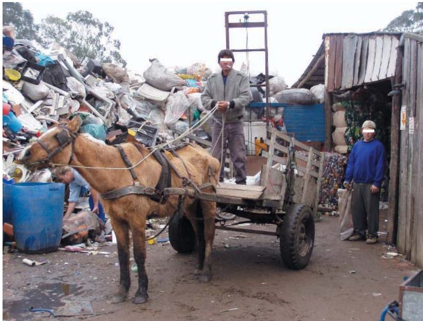
Figure 3 A ragpicker, on his horse-drawn cart. He has brought material to a collection point, where a middle man will weigh his material, and pay him cash for it.

rate. Sometimes, they may be paid in food products in addition to cash.