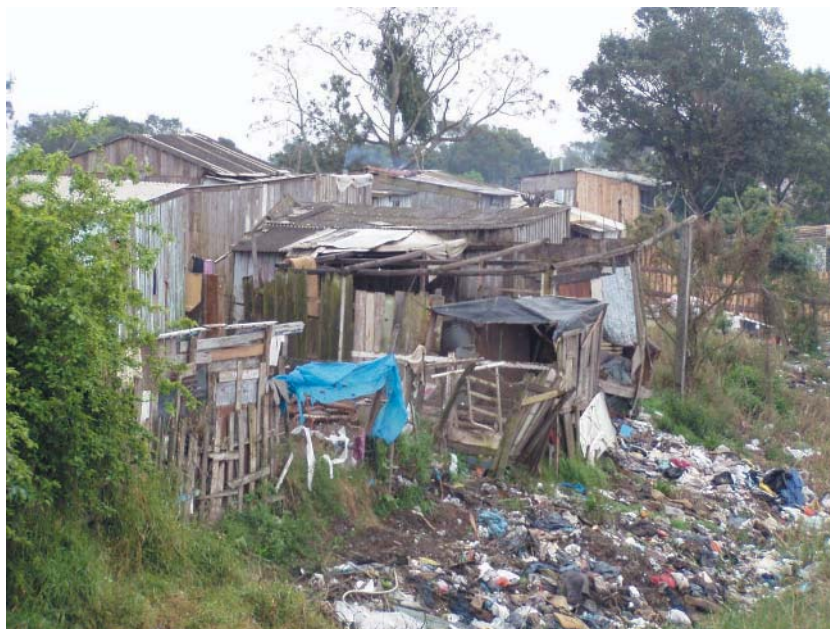
Figure 1 Houses of ragpickers are often of very poor condition. They bring garbage back to the house to separate it, and there are often piles of non-recyclable waste dumped nearby.

Almost half (47%) of the ragpickers were non-white, compared to 32% of non-ragpickers, and only 15% of the Pelotas general population. Although we attempted to match non-ragpickers to ragpickers to within one year of schooling, the differences were so marked that our samples retained some striking differences in education. Fully 22% of ragpickers had not completed a single year of schooling, while only 12% of the non-ragpicker sample had no schooling. In the general population sample, only 1% reported less than one year of schooling (table 1).