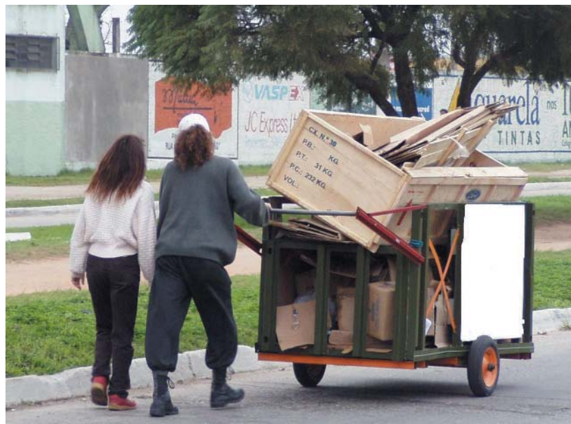
Figure 2 Ragpickers at work in the streets of Pelotas. Pushcarts are commonly used to collect and transport waste.

Recyclable materials are transported from the ragpickers' households to local "middle man" businesses that purchase recycled products ( sucateiros in Portuguese) (fig 3). The ragpickers bring their collections to these businesses for weighing; and they are paid directly in cash, on the basis of the current market