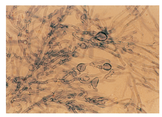
Figure 2 KOH-Quink stain of the vegetation showing septate hyphae typical of Aspergillus sp later defined as A niger. Orig \times 40

months and subsequently with itraconazole for a year. A repeat TOE 6 months after surgery revealed only mild mitral regurgitation. At present, 16 months after surgery, the patient is doing well, without evidence of recurrence.