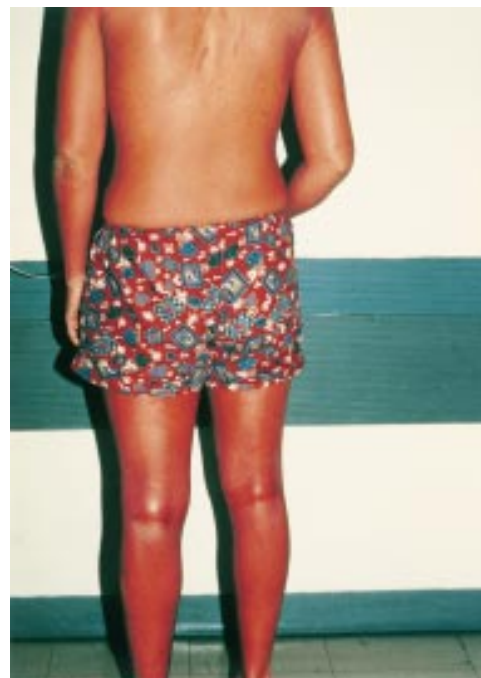
Figure 1 Erythroderma after three weeks of amitriptyline initiation (reproduced with the patient's permission).

A bone marrow specimen showed a normal erythroid cell line, normal megakaryocytes, and a remarkable increase of eosinophils in the