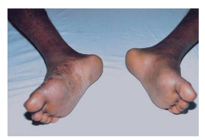
Figure 2 Keratosis of soles on day 13th of illness.